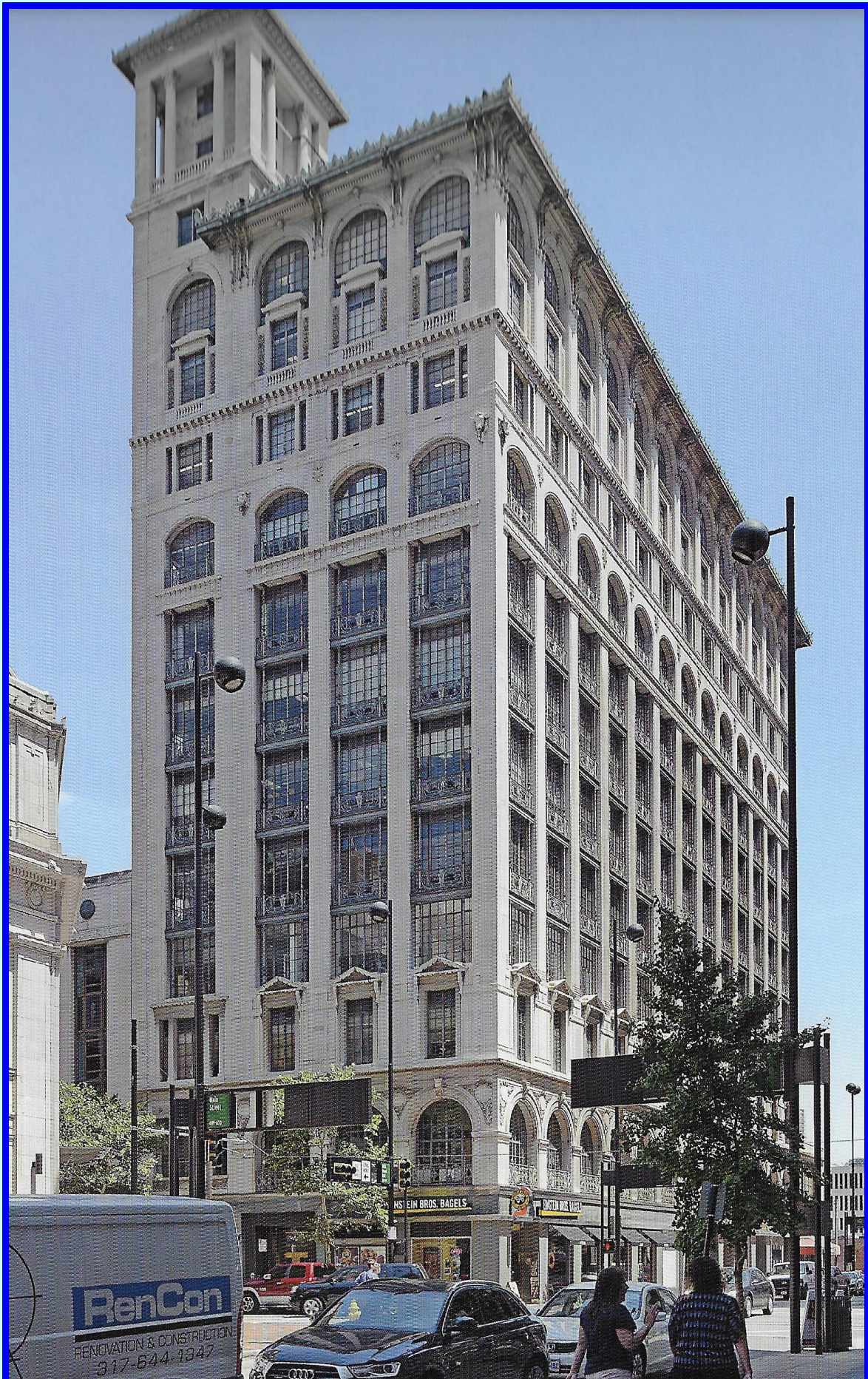
Headquarters of Proctor & Gamble 1914-56, still "one on the city's handsomest buildings."