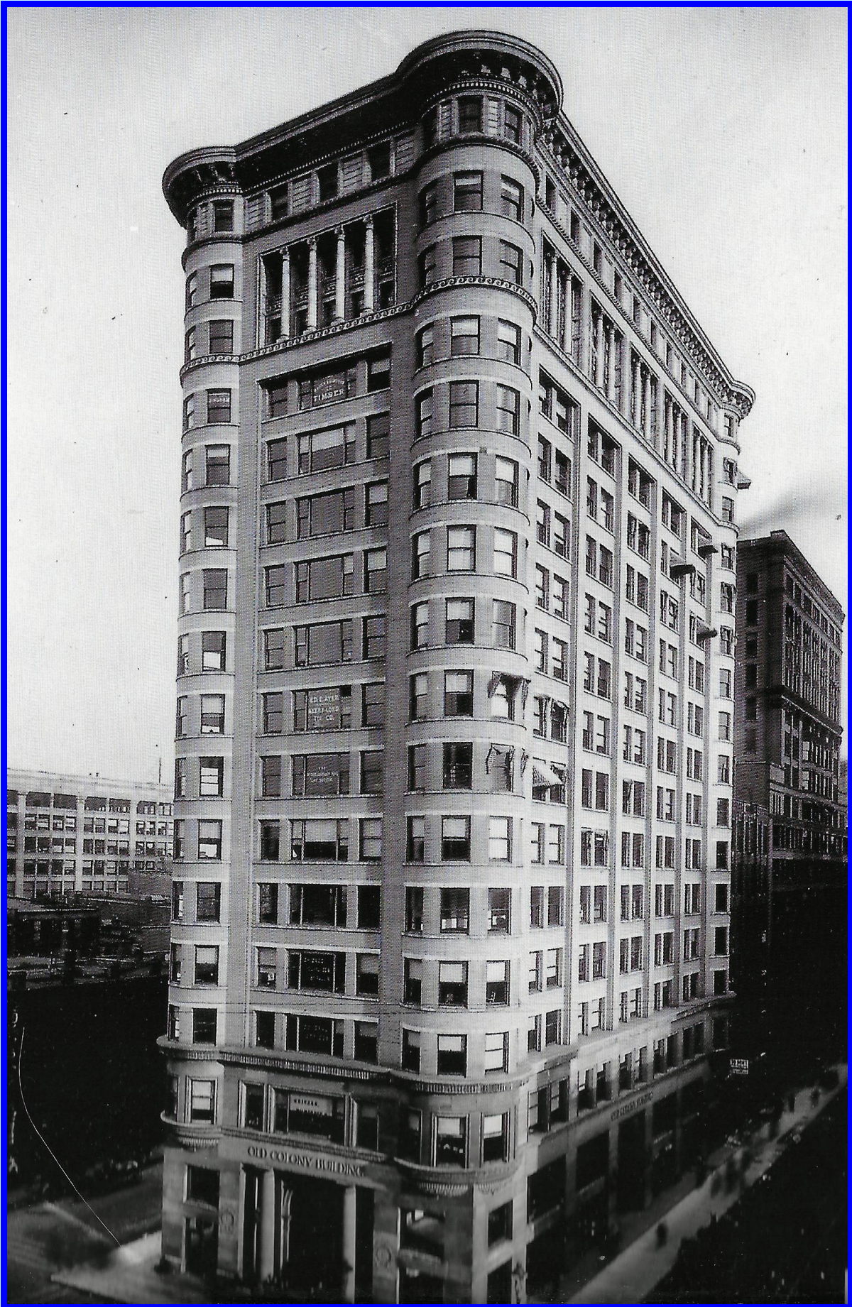
Date of photograph 1895. With 17 floors, the "first to use skeleton construction throughout."