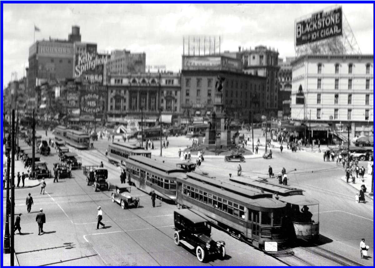
Trams and traffic in early Detroit.