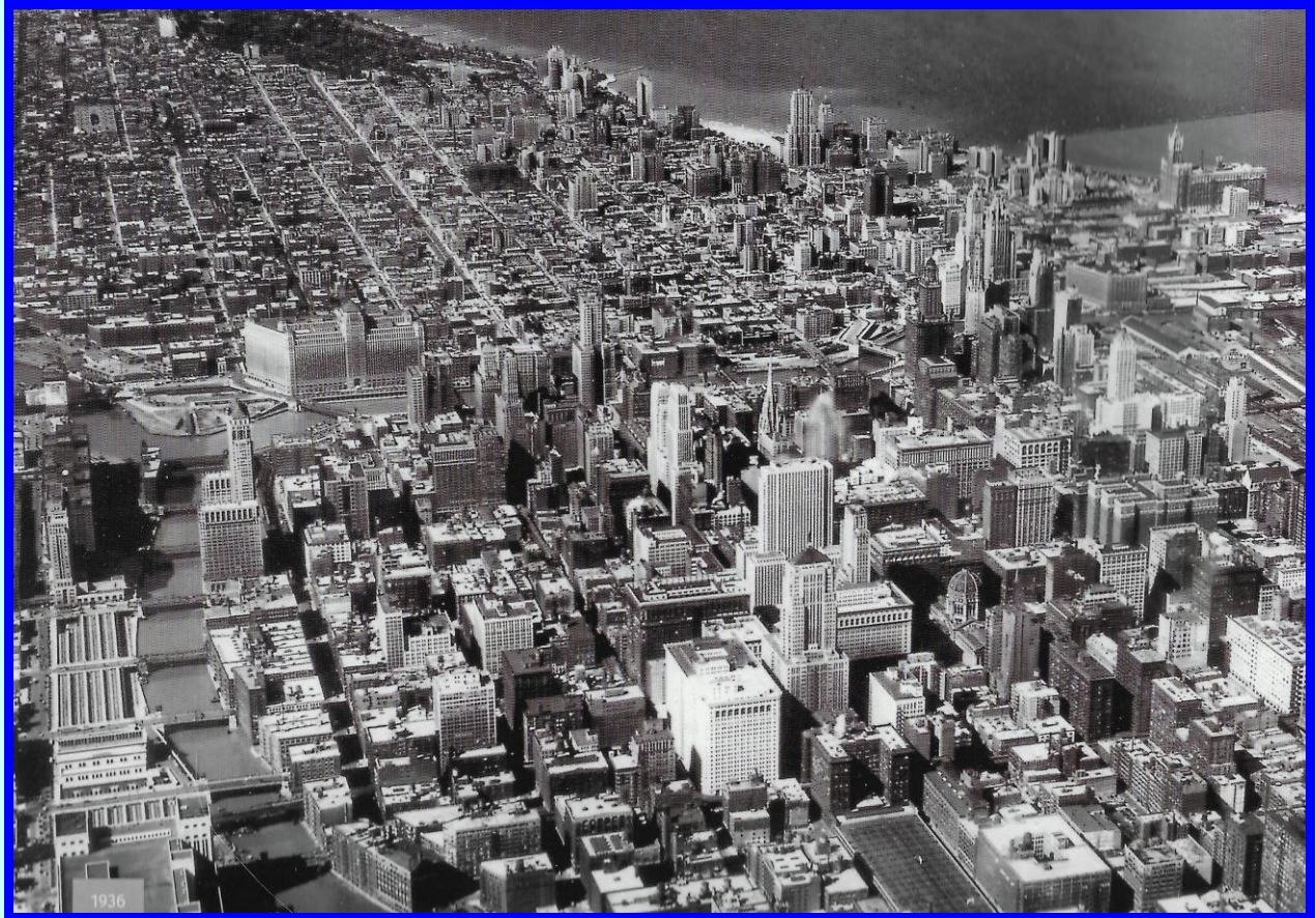
Chicago from the air in 1936.