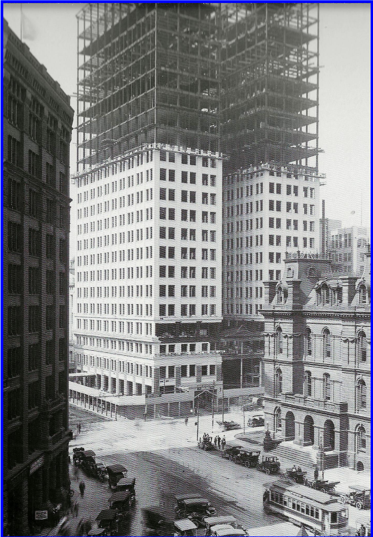
Date of photograph 1910. The twin towers under construction.