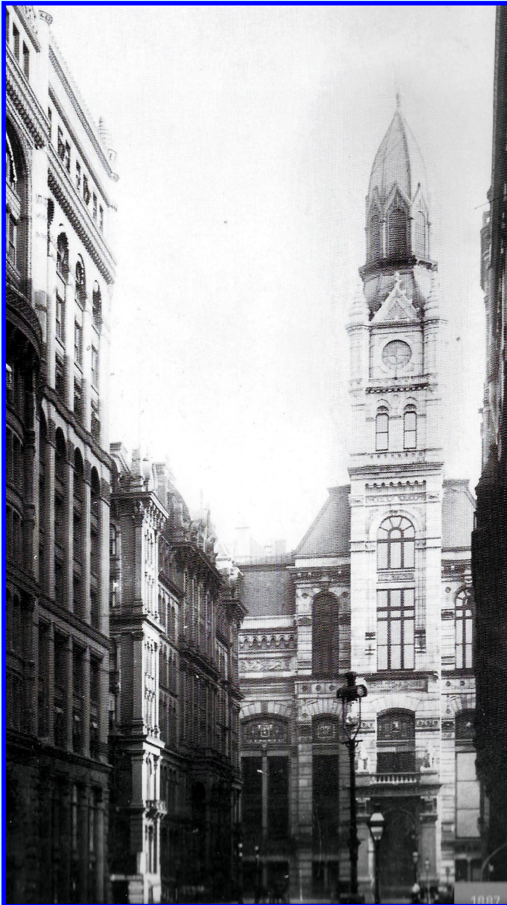
Date of photograph 1877 showing 320 ft high clock tower, then tallest in Chicago.