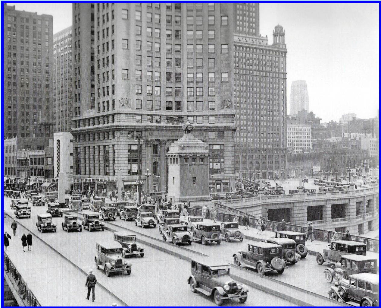
Michigan Avenue Bridge, Chicago in 1929.