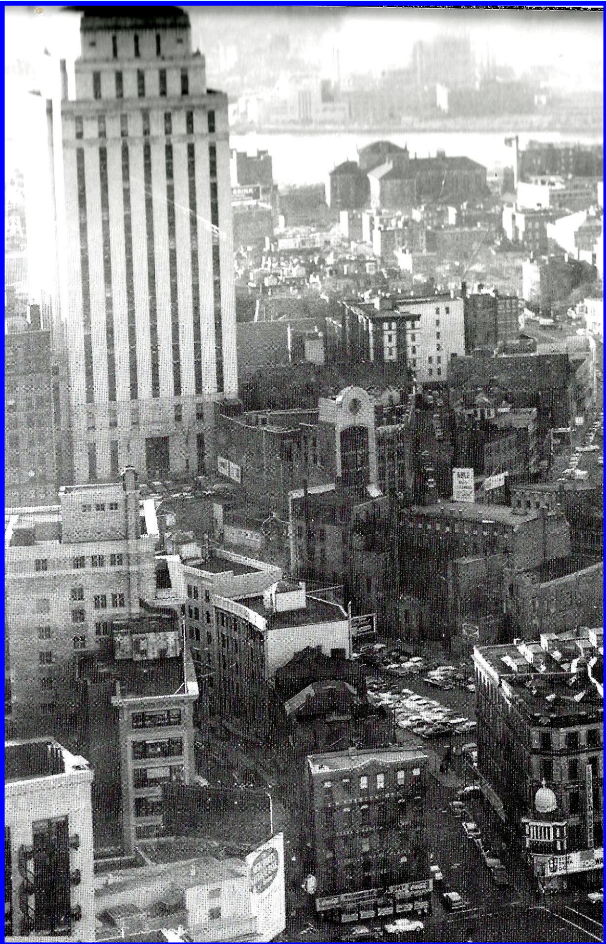
Date of photograph c.1950. West End and Scollay Square.