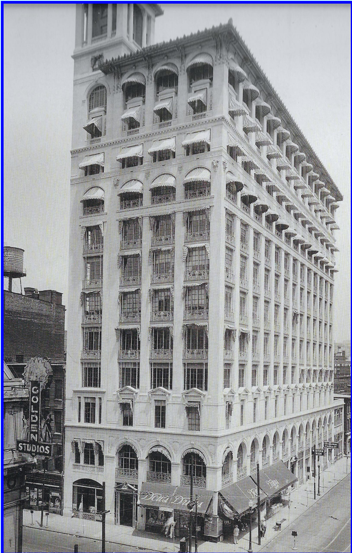
Date of photograph 1936. The building is in the French Beaux-Arts style.