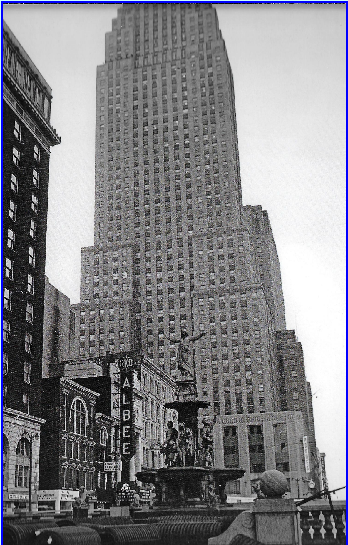
Date of photograph 1968. Built with 48 floors in Art Deco style.