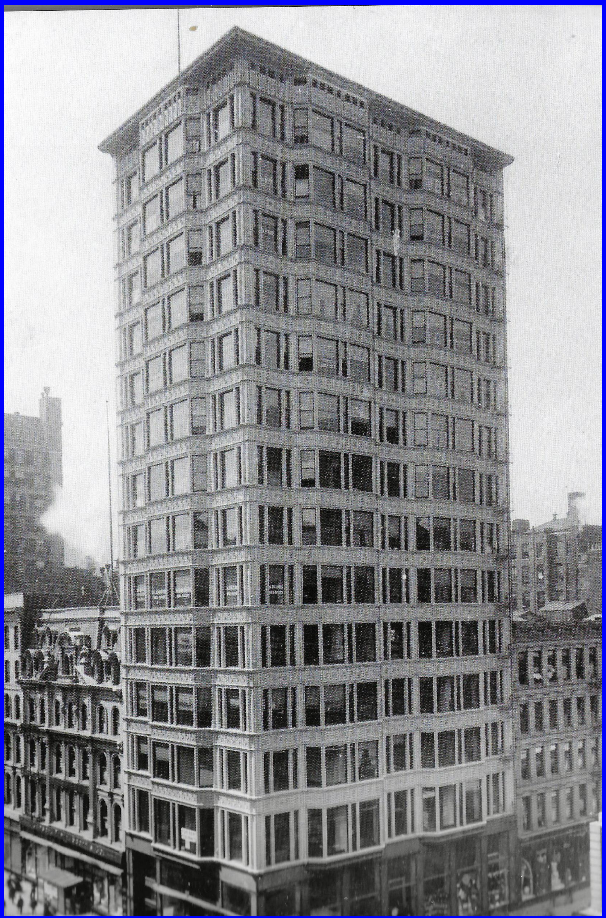
Photograph c.1900. Famous for classic "Chicago Window" and interior steel frame construction.