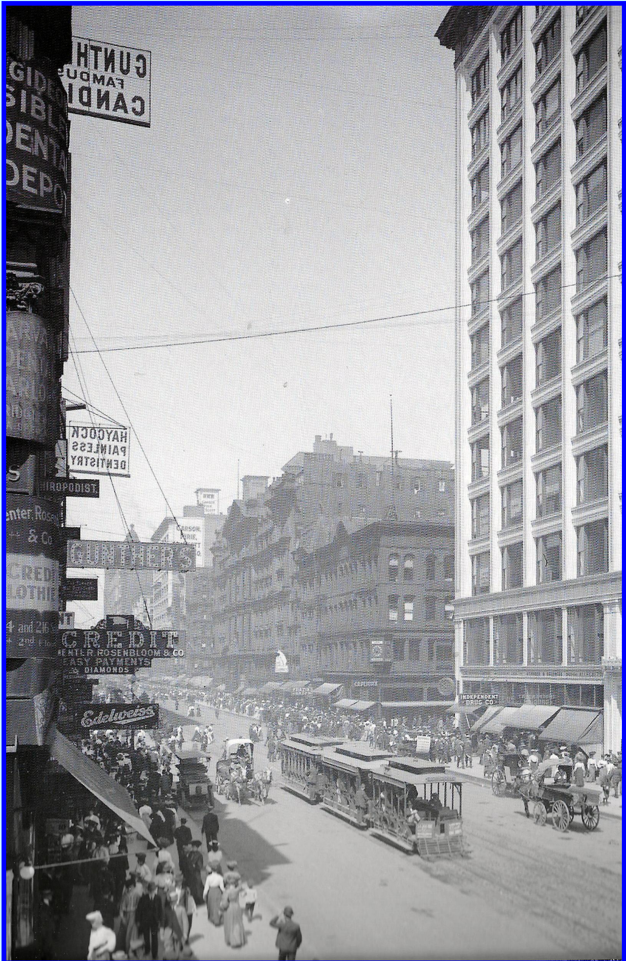
State Street, Chicago c.1905.