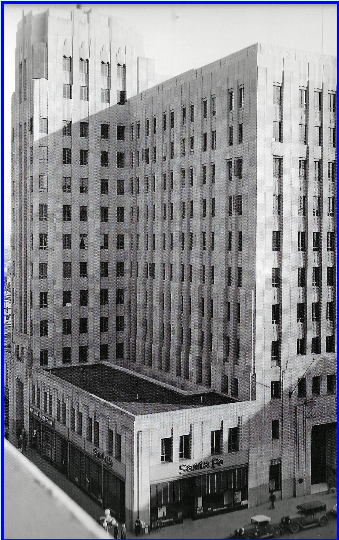
Photograph 1935. A centralized place for doctors, dentists, clinics and laboratories.