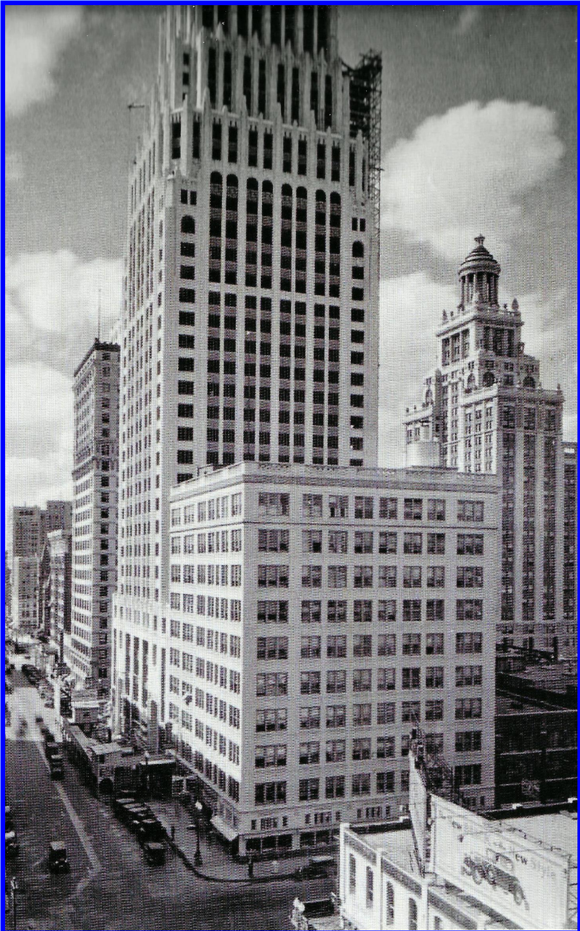
Photo 1929. An early air-conditioned skyscraper 430 ft, 37 floors. Houston's tallest until 1963.