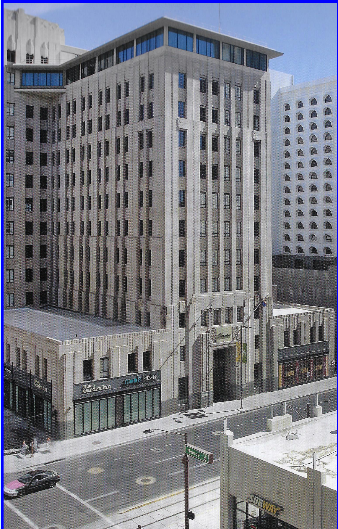
A top storey added in 1958. Also served as a Bank HQ and now a hotel.