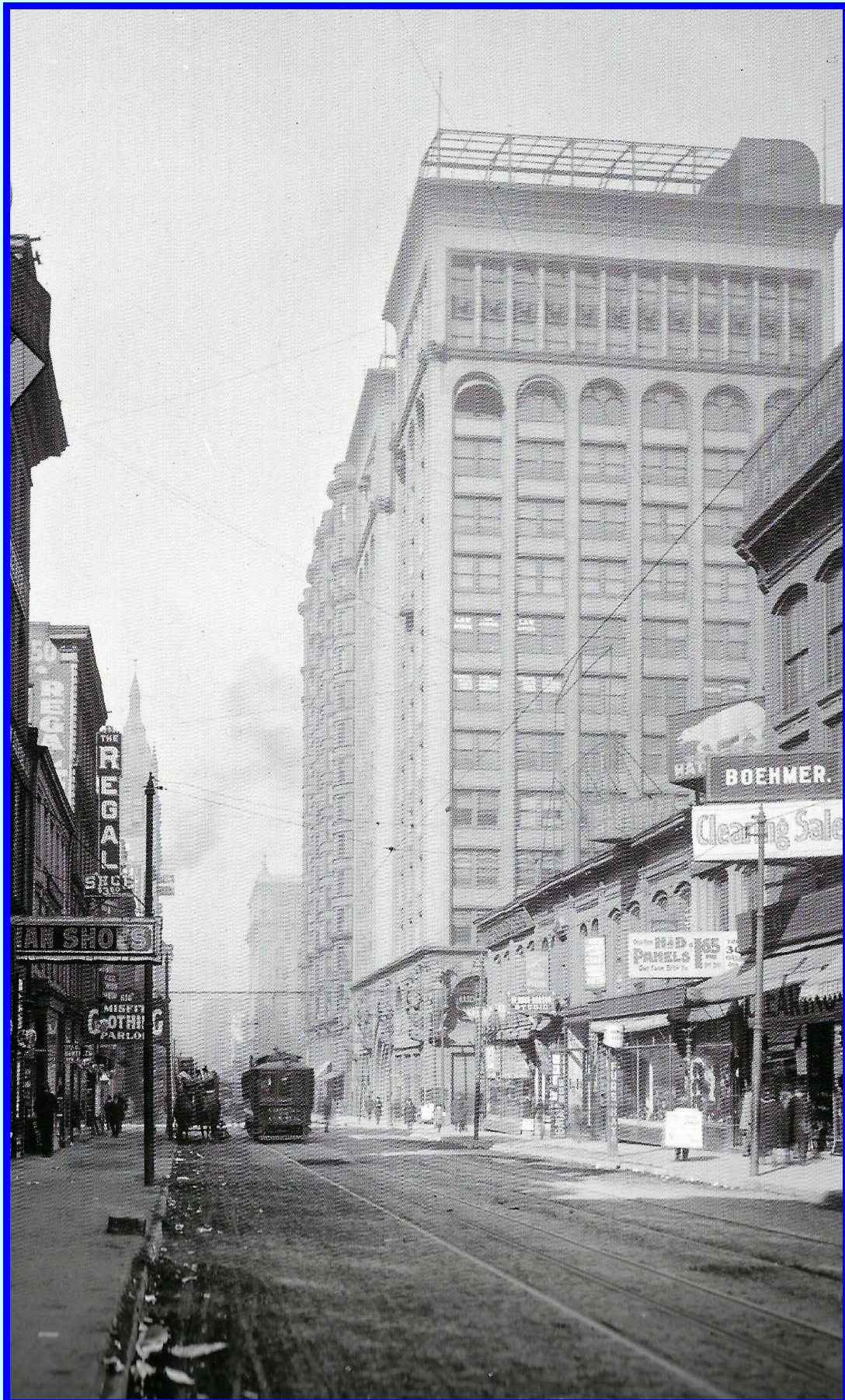
Date of photograph c.1900. Features twin towers on a podium.