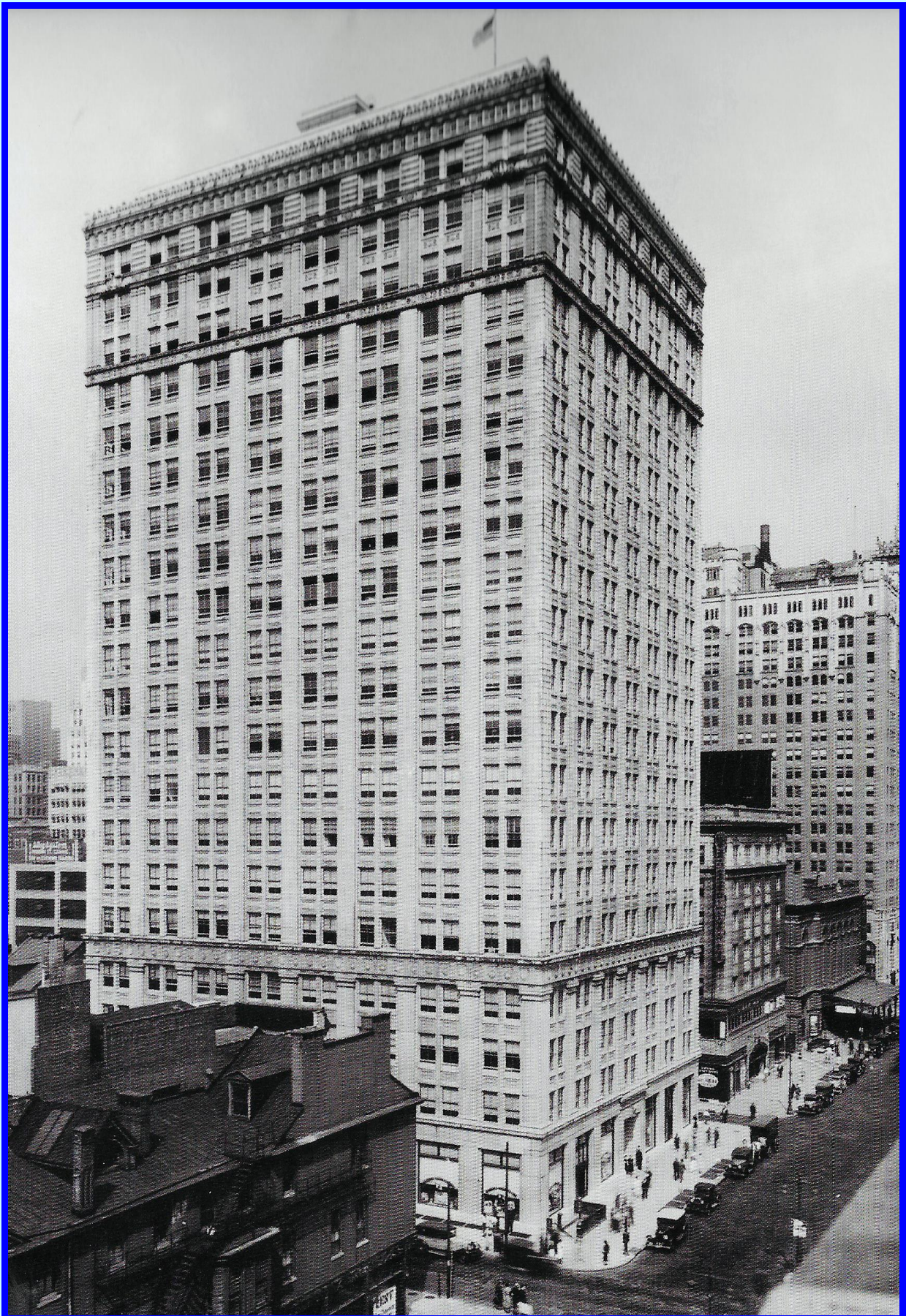
Photograph c.1925. A 22-floor office building.