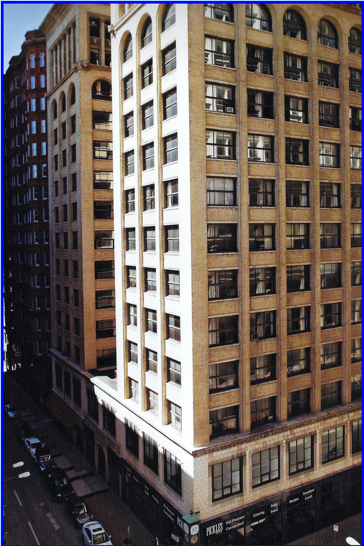
The Union Trust with the Railway Exchange and Chemical Bank buildings behind.