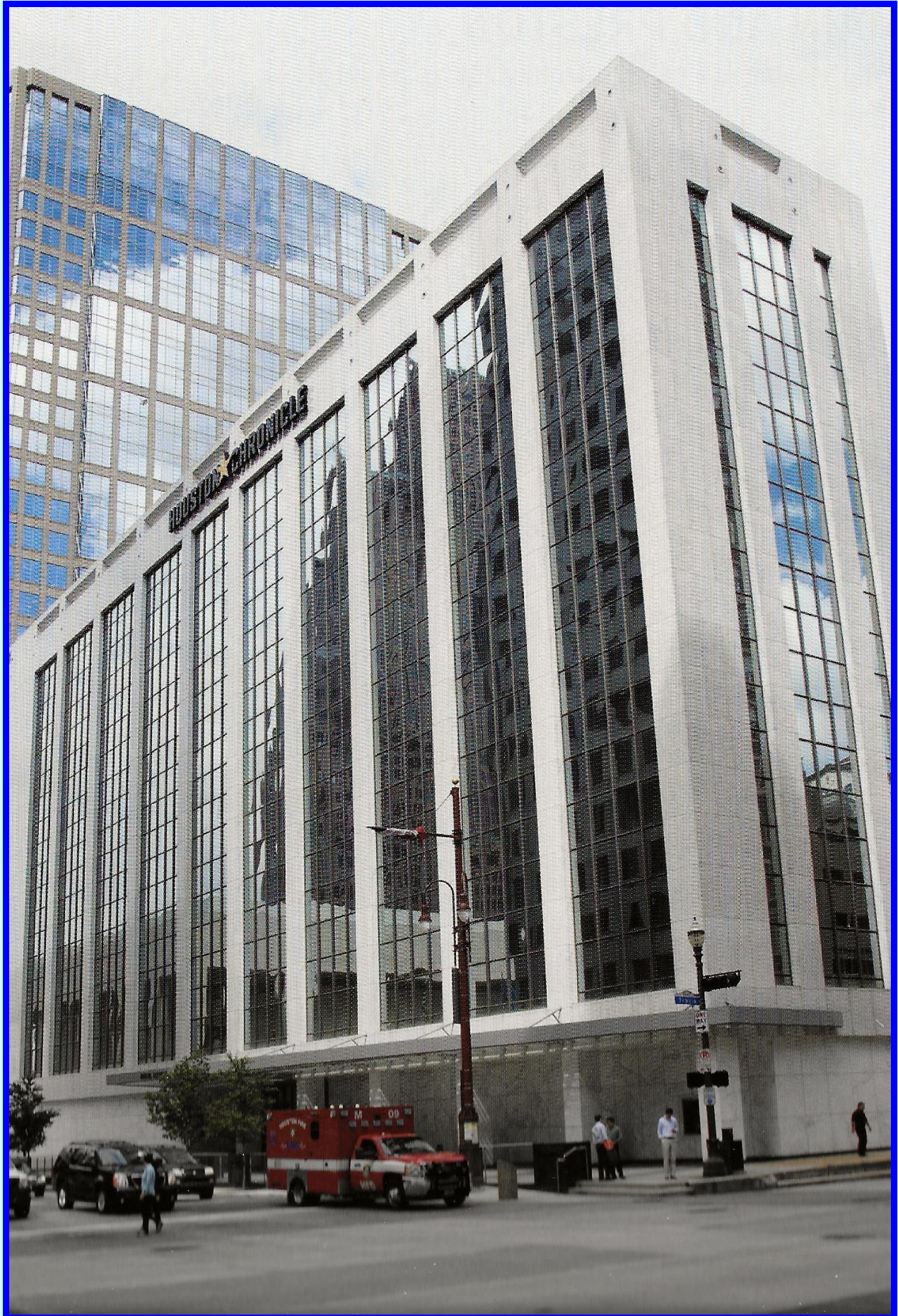
During the 1970s, four separate structures were brought together to form the Chronicles HQ.