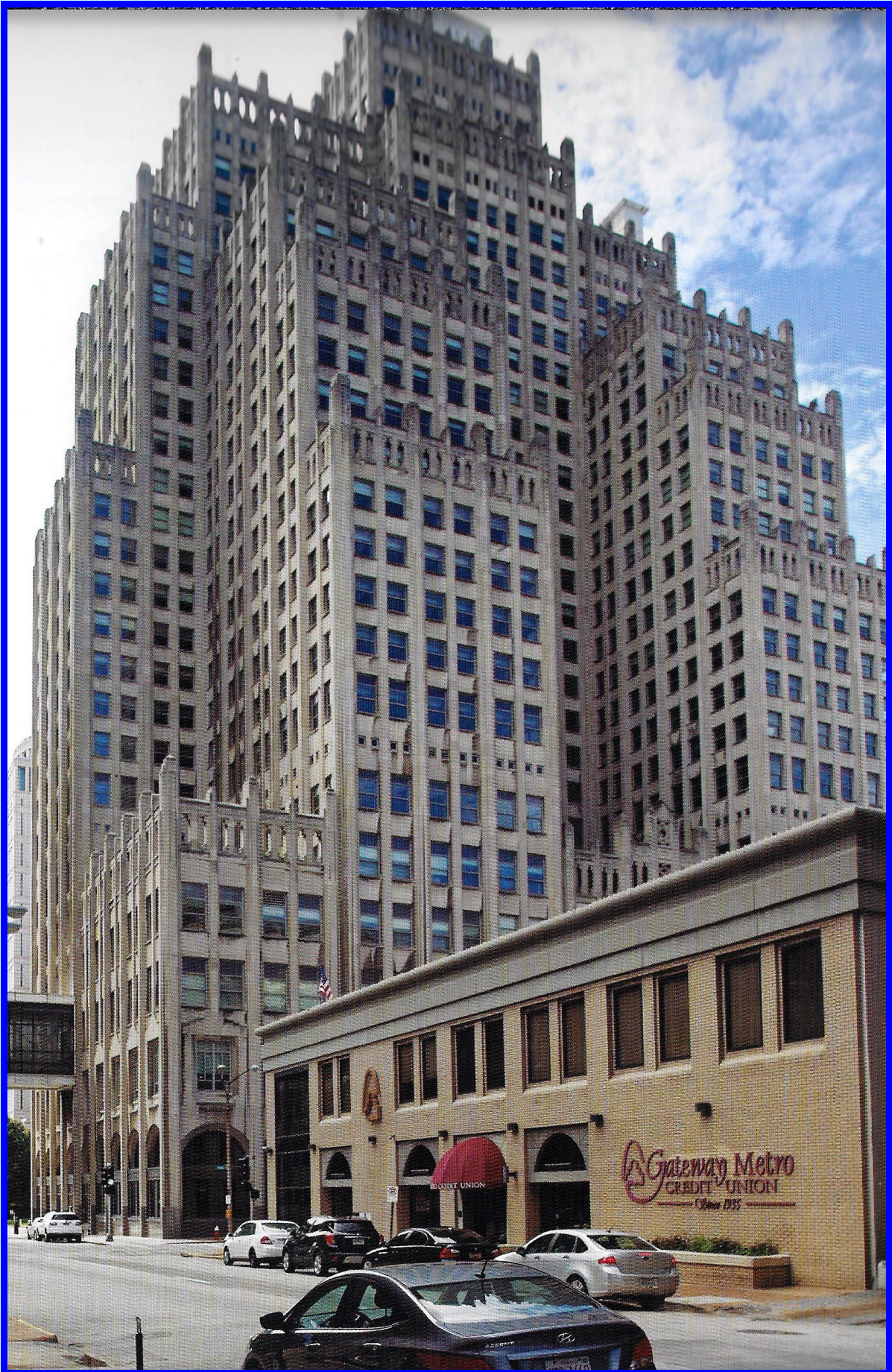
Connected by a skywalk (not visible) to One Bell Centre, Missouri's largest building.