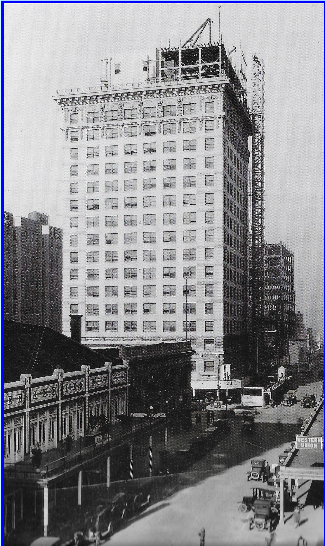
Photograph 1923. Built by "Lumber King" at 16 floors thought by locals to be impossible.