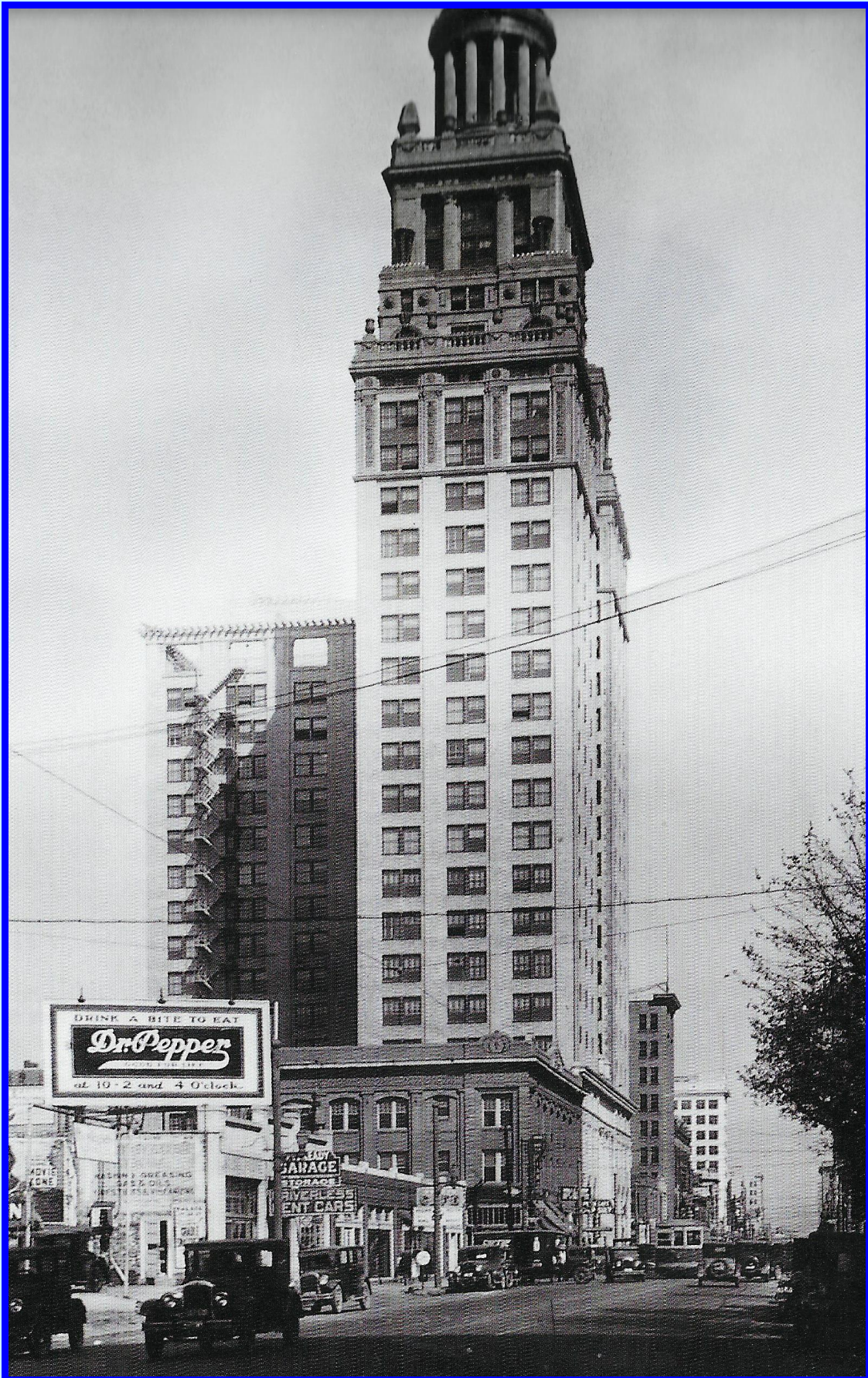
Date of photograph 1927. Built and named after Oil Baron by his widow.