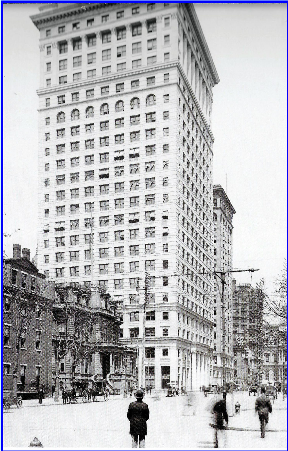
Photograph c.1905. At 16 floors, one of Philadelphia's earliest skyscrapers.