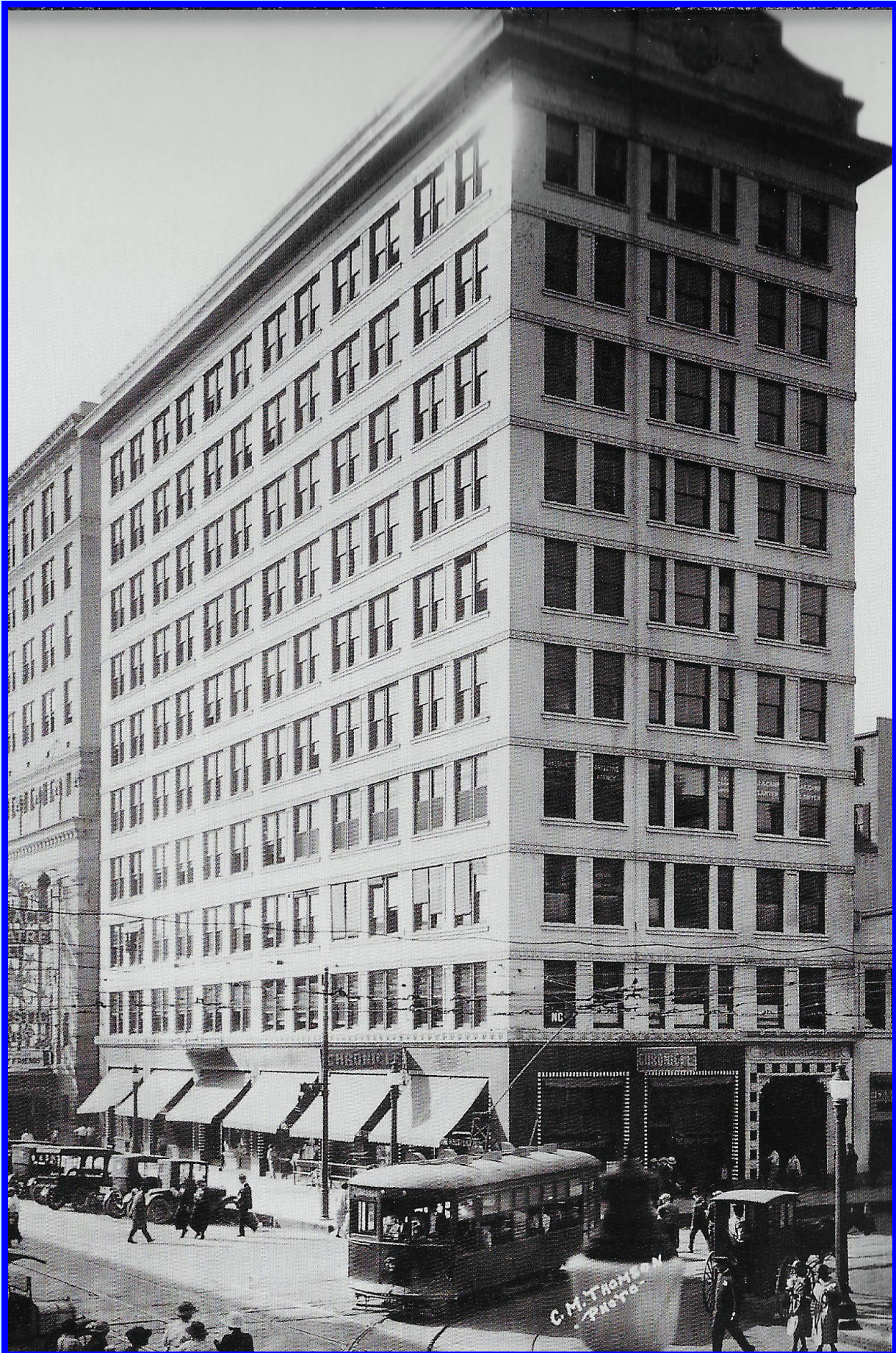
Date of photograph 1923 showing the building as 10 floors high.