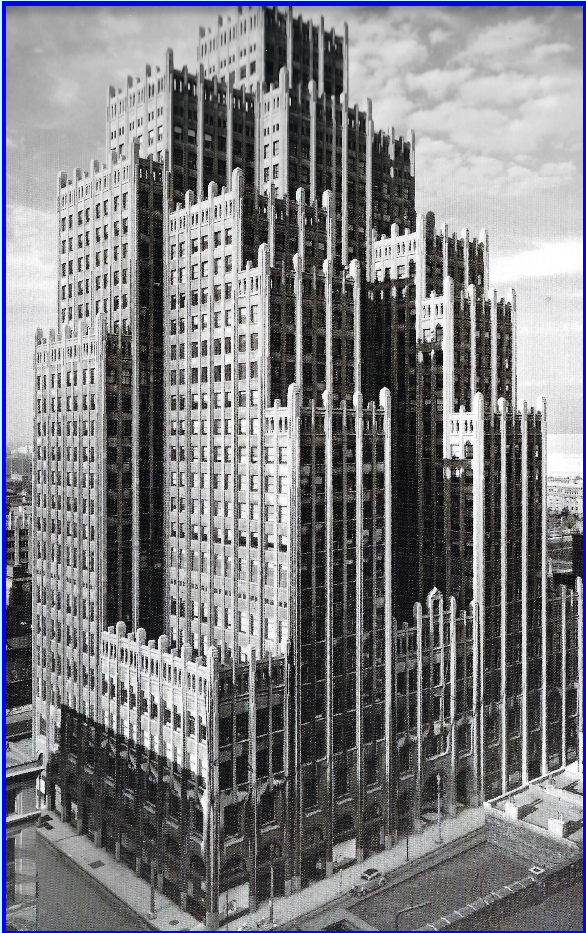
Photograph c.1937. There are 28 floors, Building is 397 ft high and has 17 roof setbacks.