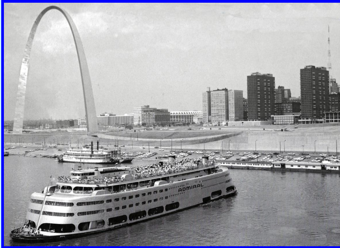
St. Louis Gateway Arch at 630 ft and the River Mississippi.