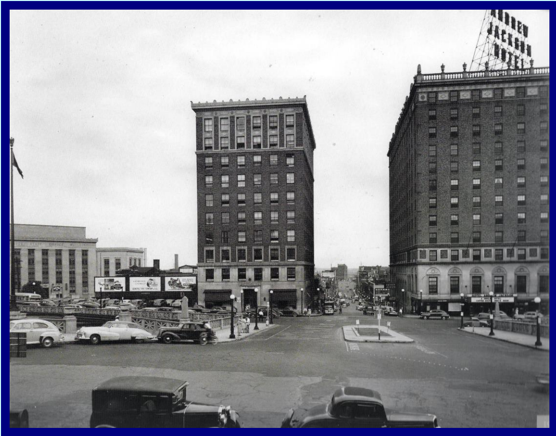
Photograph 1948. Connected to the Elvis Presley first No.1 hit "Heartbreak Hotel."