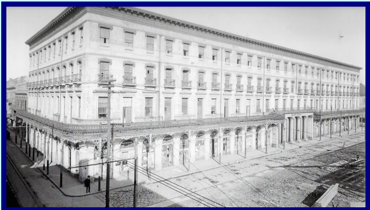
Photograph 1906 having become Municipal Offices in 1882. Torn down 1915.