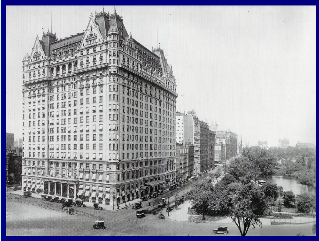
Photograph c.1910. "The most fashionable hotel of its day."