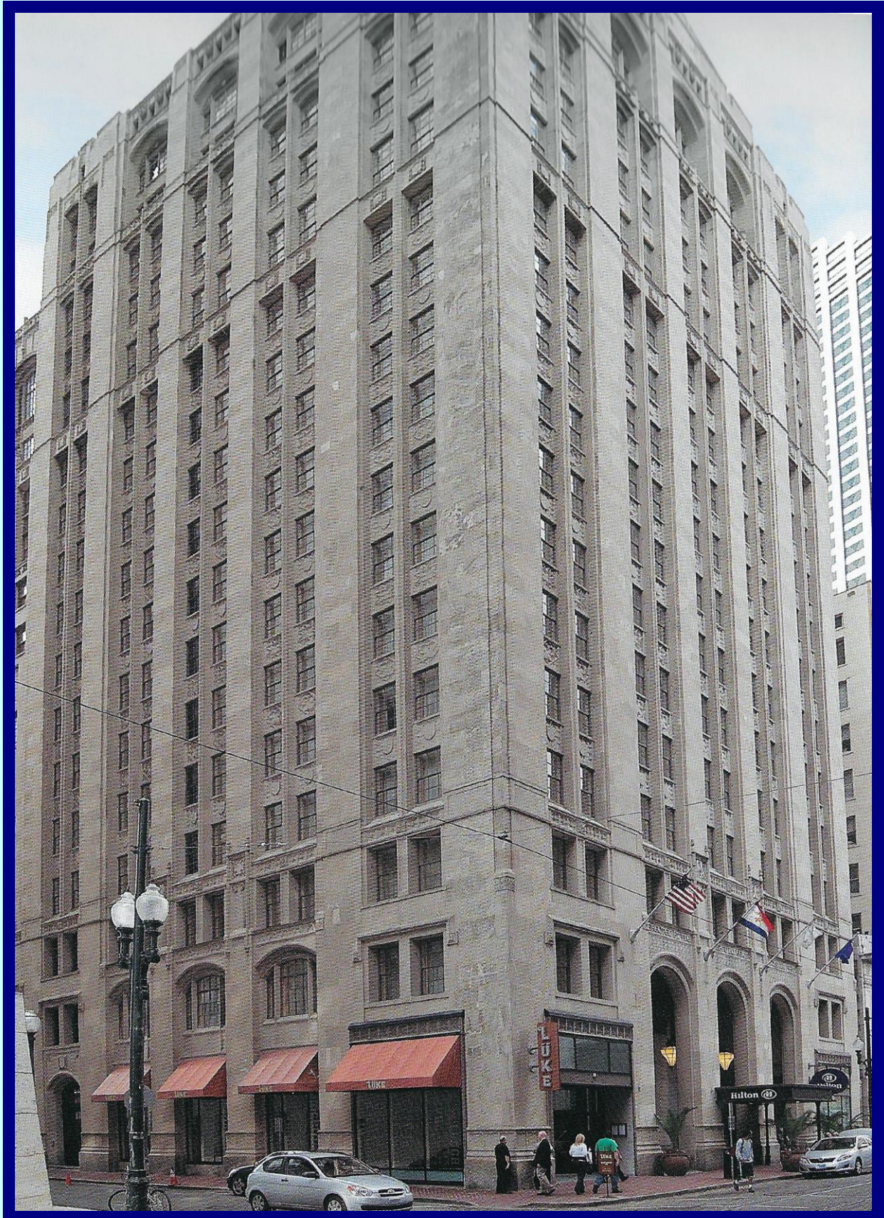
Built on the site of the 1891 Masonic Temple. Opened 1977. 29 floors, 341 ft, 1700 rooms.