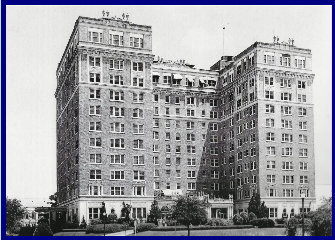
Photograph 1926. Originally 11 floors of apartment, opened as hotel 1964 with guest Cary Grant.