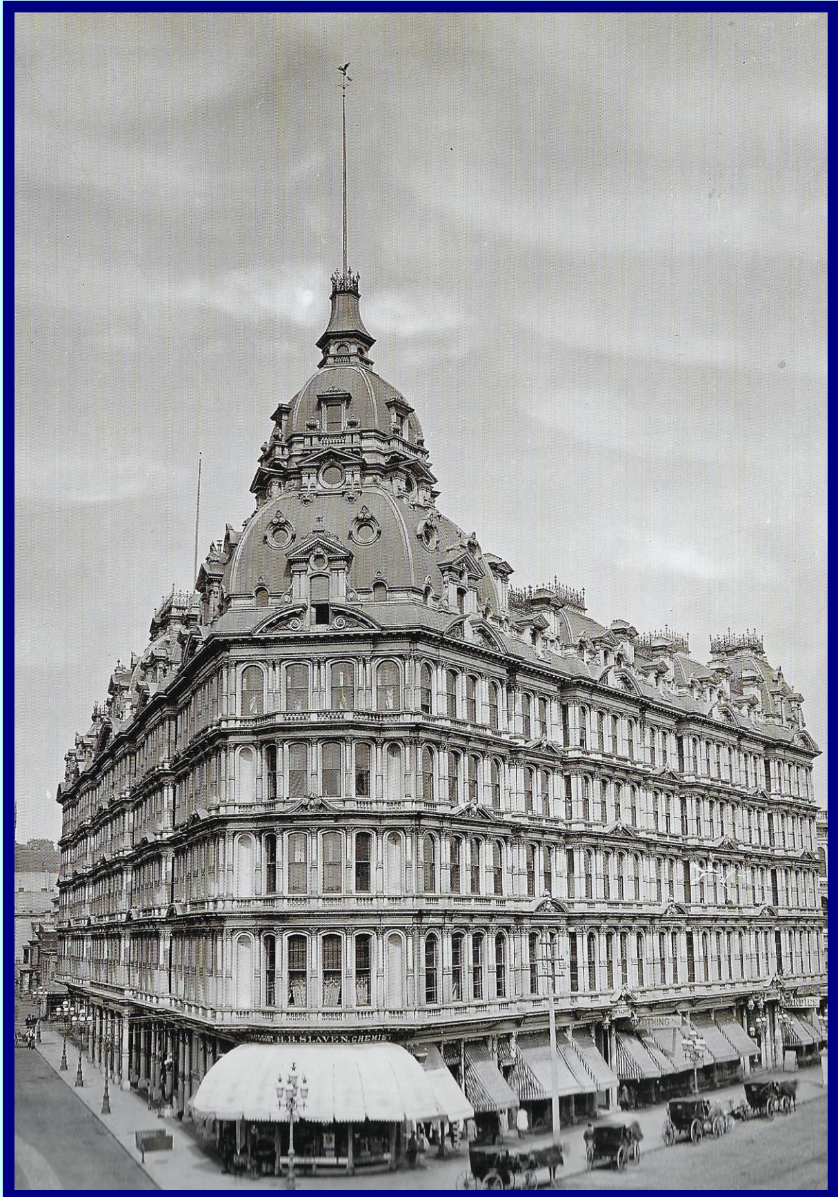
Photograph 1878. The hotel was badly damaged by fire in 1898. A replacement, the Flood Building, was completed in 1904 and at nearly 300,000 sq. ft and 12 floors was the largest building in San Francisco and survived the 1906 disasters. It is now mixed-use offices.