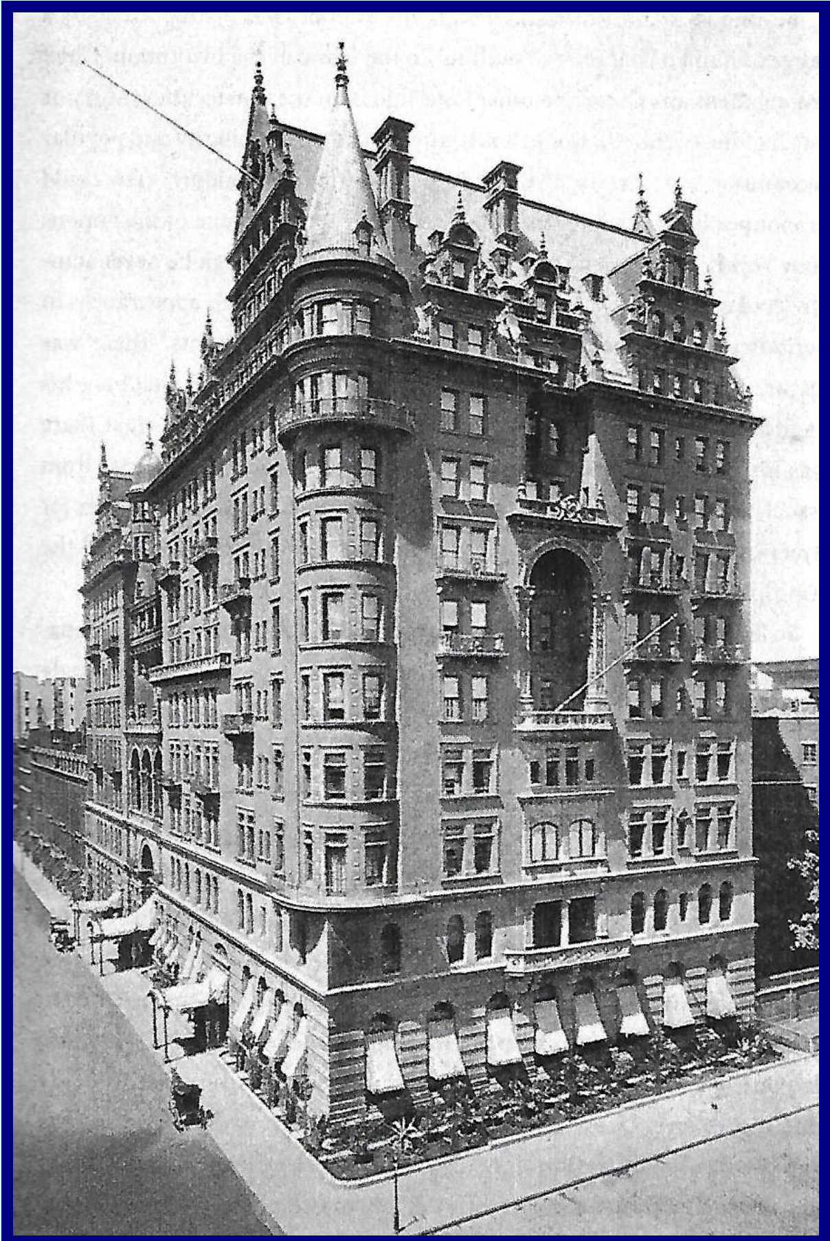
Photograph 1893. The Hotel Waldorf shortly after completion.