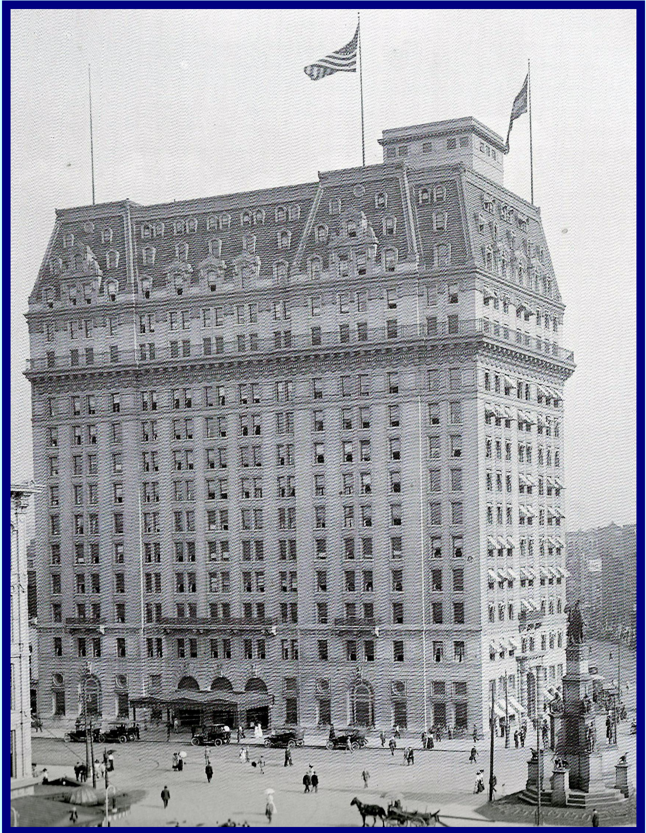
Photograph c.1910. The Russell Hotel was built in 1857 and rebuilt in 1881.

Situated on the Campus Martius (Field of Mars) where troops paraded throughout the Civil War. Lower right of photo is the Michigan Soldiers and Sailors Monument.