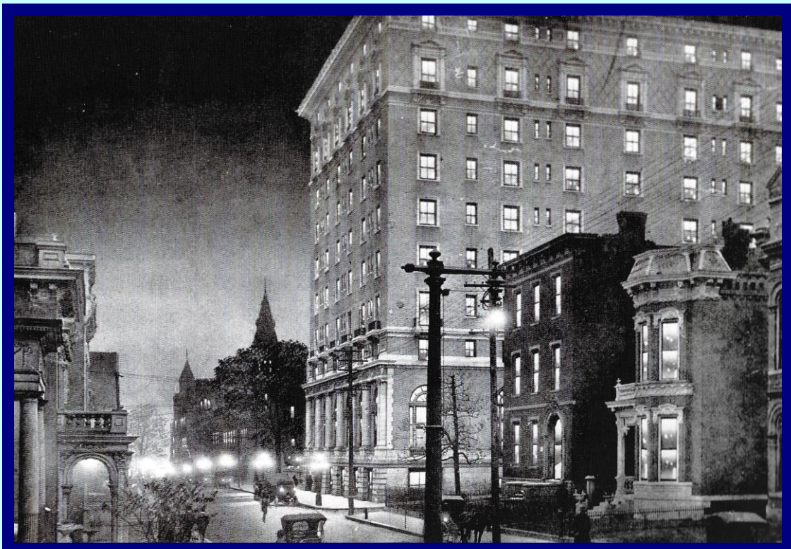
Photograph c.1915. "Fireproof, dust proof and sound proof." Renovated 2003.