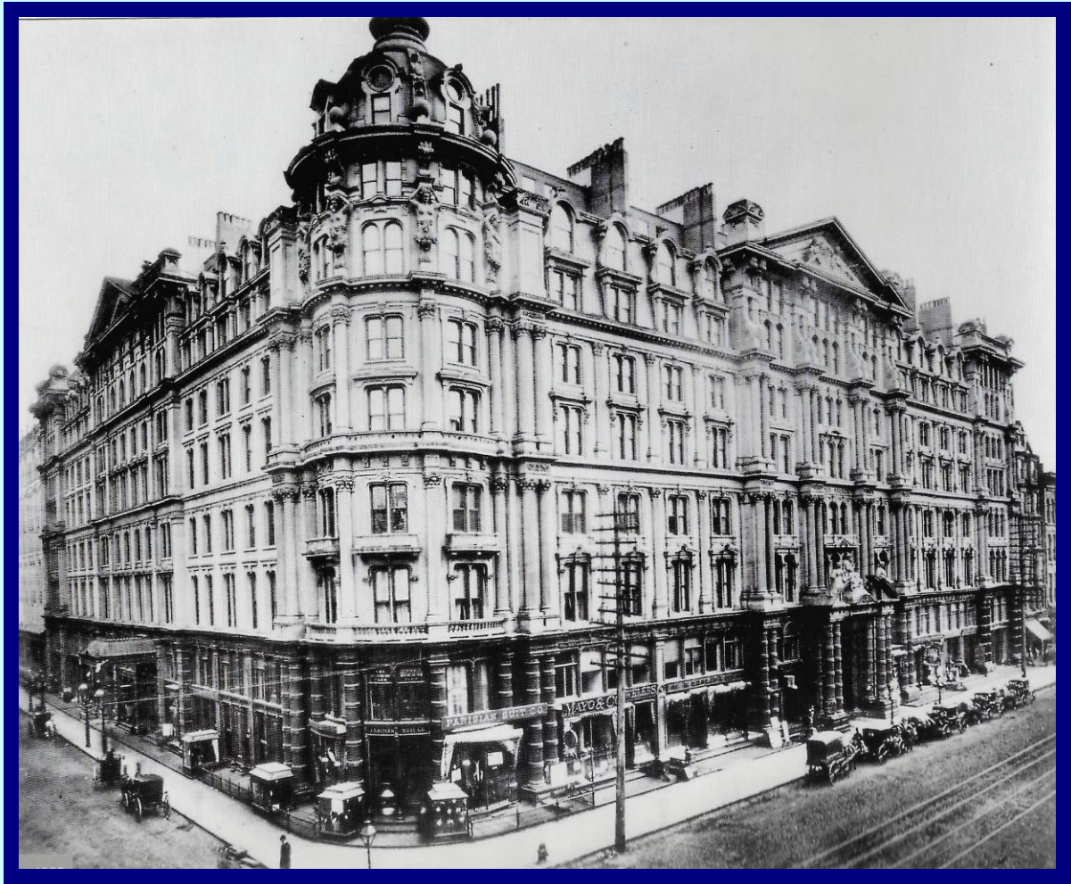
Photograph c.1885. The third Palmer House opened in 1927.