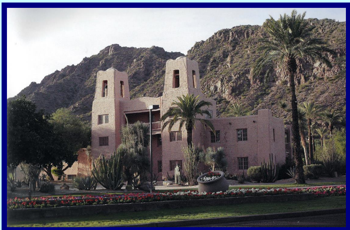
A tea-room in 1926, a hotel in 1928. Later Paradise Inn, now lost, its site part of a golf course.