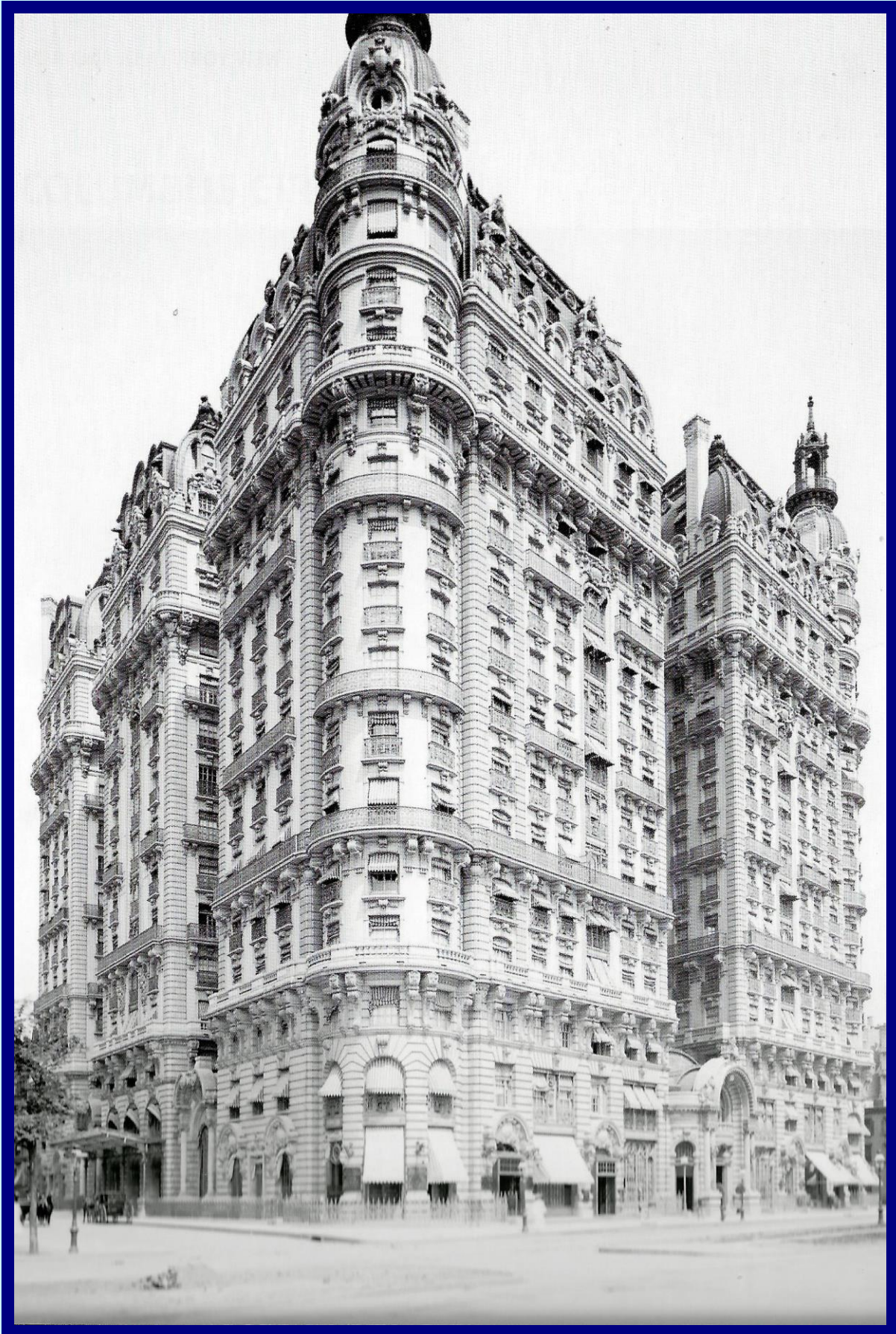
Photograph 1904. "A lavish residential hotel." Said to be the first air conditioned hotel in New York.