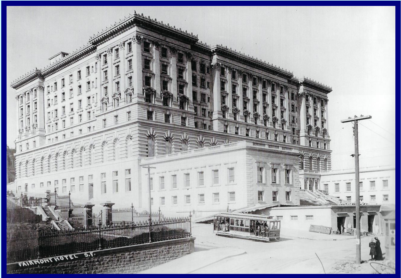
Photograph 1907. Originally to open 1906 but delayed by earthquake and fire damage.

The Heritage Group has recorded details of the history and engineering services in a variety of HOTELS, buildings which have the largest range of engineering services (except in possibly some hospital and industrial applications). These include HVAC, Plumbing, Elevators, Fire Safety, Security and Communications: serving Bedrooms, Suites, Kitchens, Laundries, Reception and Staff Areas, Plant Rooms, Restaurants, Conference Facilities, Car Parking and so on. This book shows photographs of the architecture of a small sample of historic hotels, some of which are more than 100 years old, some which are no more.