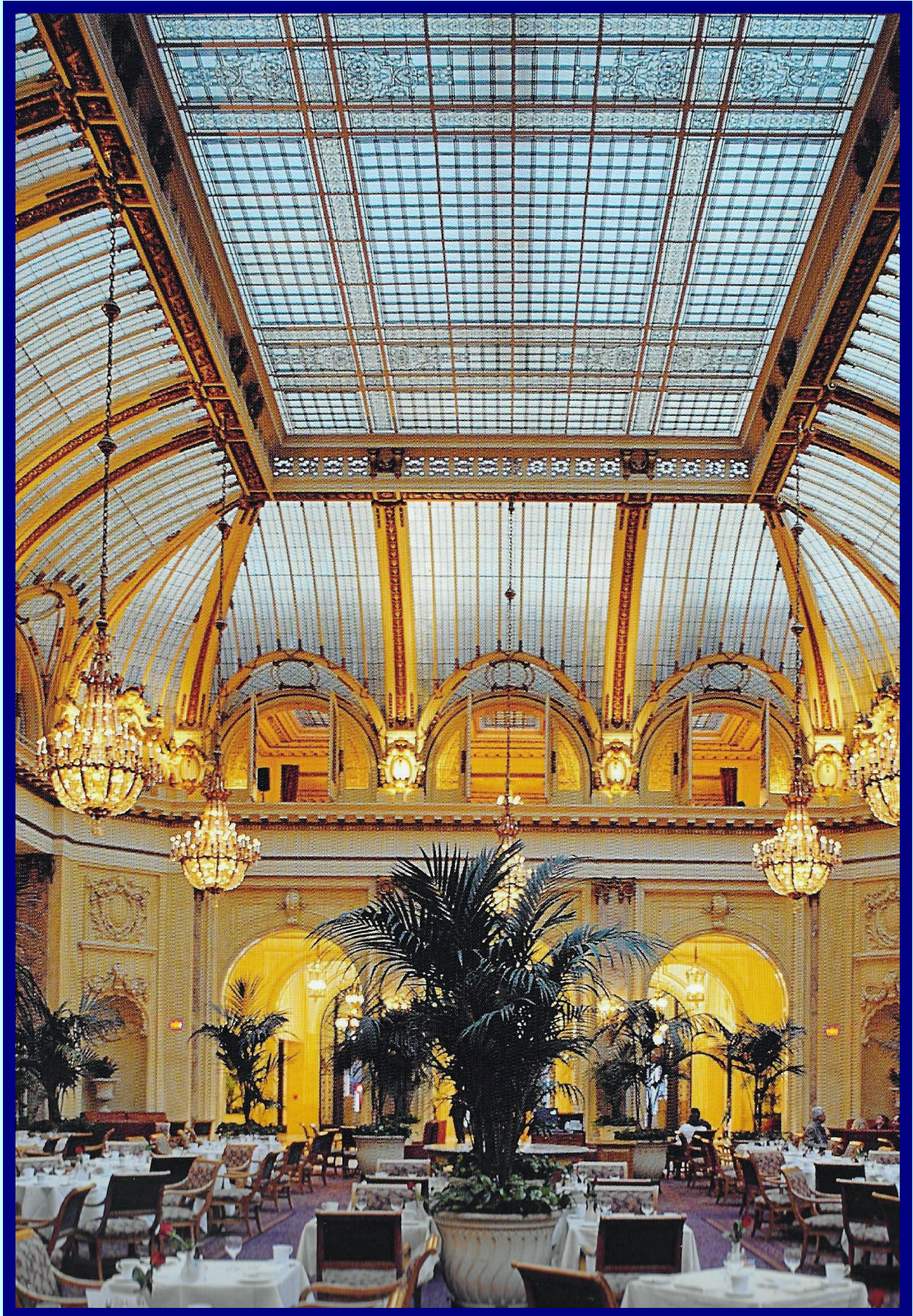
When reopened in 1909, the carriage entrance had been transformed into the Garden Court.