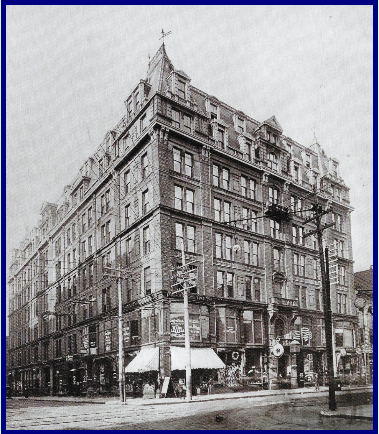
Photograph 1895. The City's oldest hotel.

Once the city's tallest building, having 8 floors with 300 rooms, incandescent lighting and hydraulic elevators, but each floor had only two bathrooms per floor.