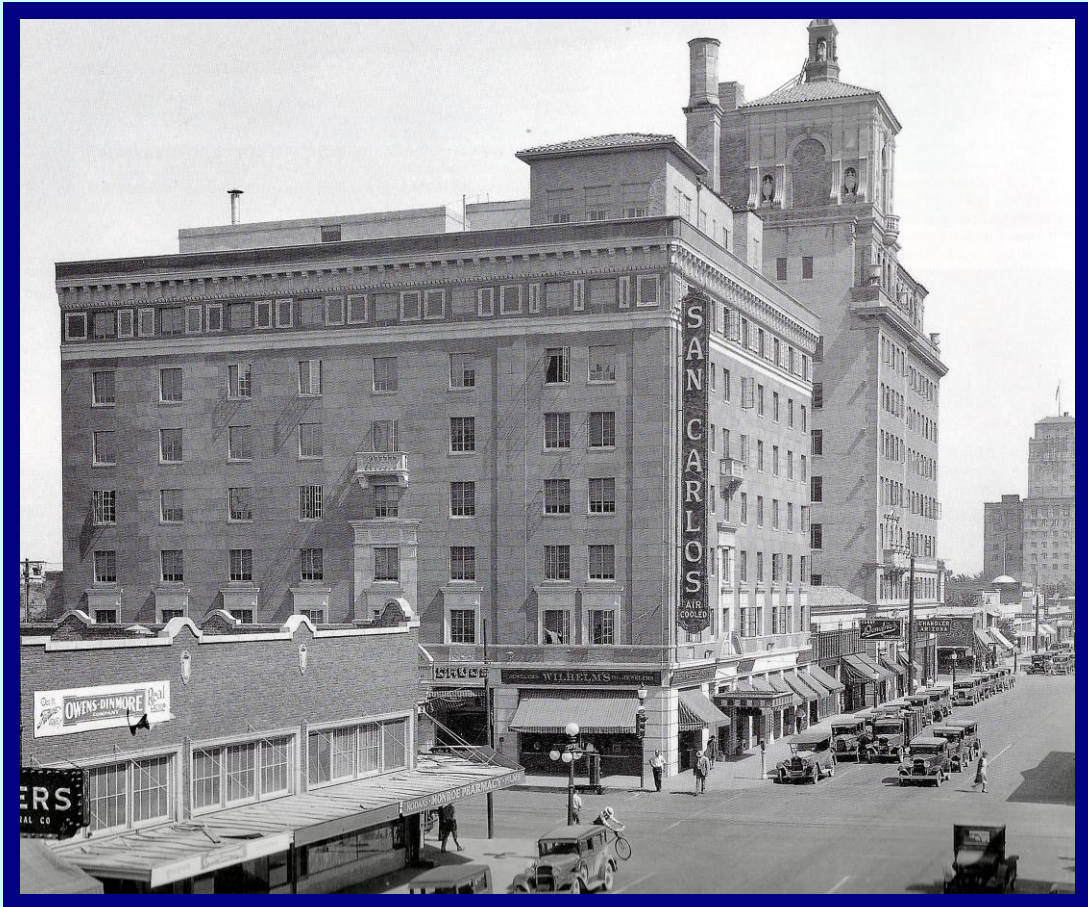
Photograph 1930. Built in 1928, the hotel had "air conditioning, steam heat and elevators."