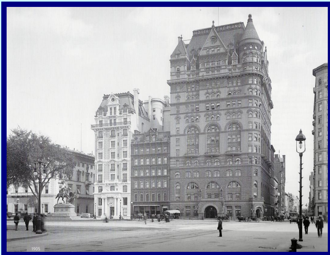
Photograph 1905. A 15-floor famous "skyscraper hotel, replaced 1927 by the 38 floor Sherry-Netherland, then the tallest hotel in the world.