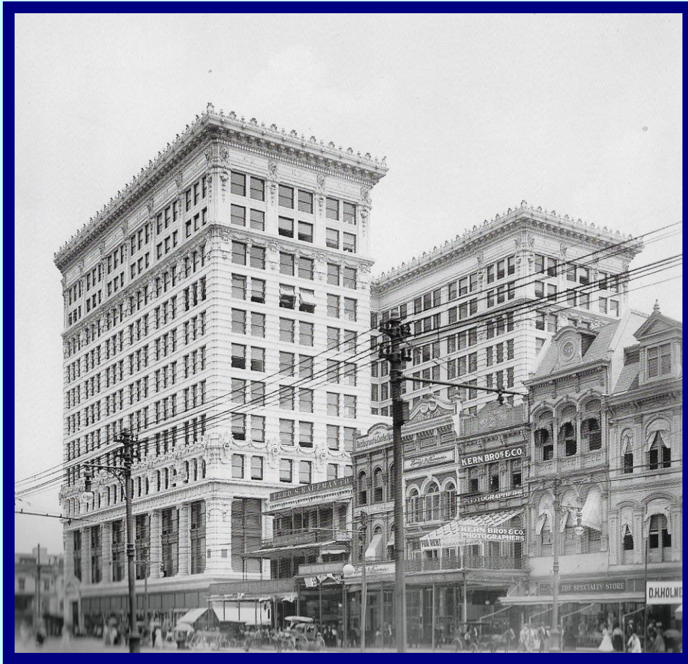
Photograph 1910. Once a Department Store, years later in 2000 became the Ritz-Carlton Hotel.