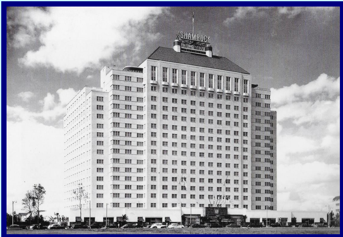
Photograph 1949. 18 floors, 1100 rooms, 1000 car garage.

Demolished 1986. Replaced by Texas Medical Centre, but still with garage.