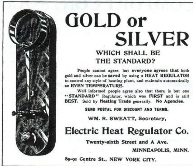
24. Advertisement: Electric Heat Regulator Co., New York. Domestic Engineering, Vol. 9, June 1985.