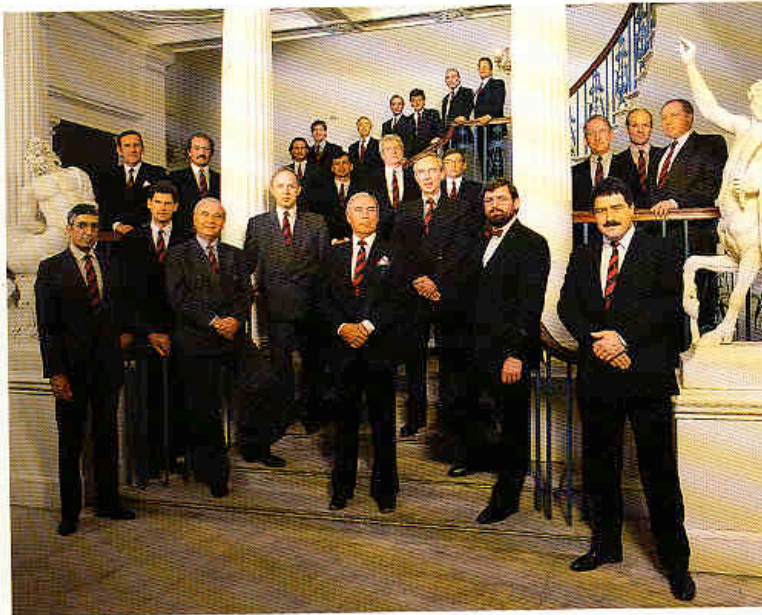
The partners and associates of FC Foreman photographed at Somerset House, London, which has been completely refurbished to house the Courtauld Institute and its fine collection of paintings. The partnership was responsible for all mechanical and electrical work to the building.

Foremans is today one of the leading firms in the country.