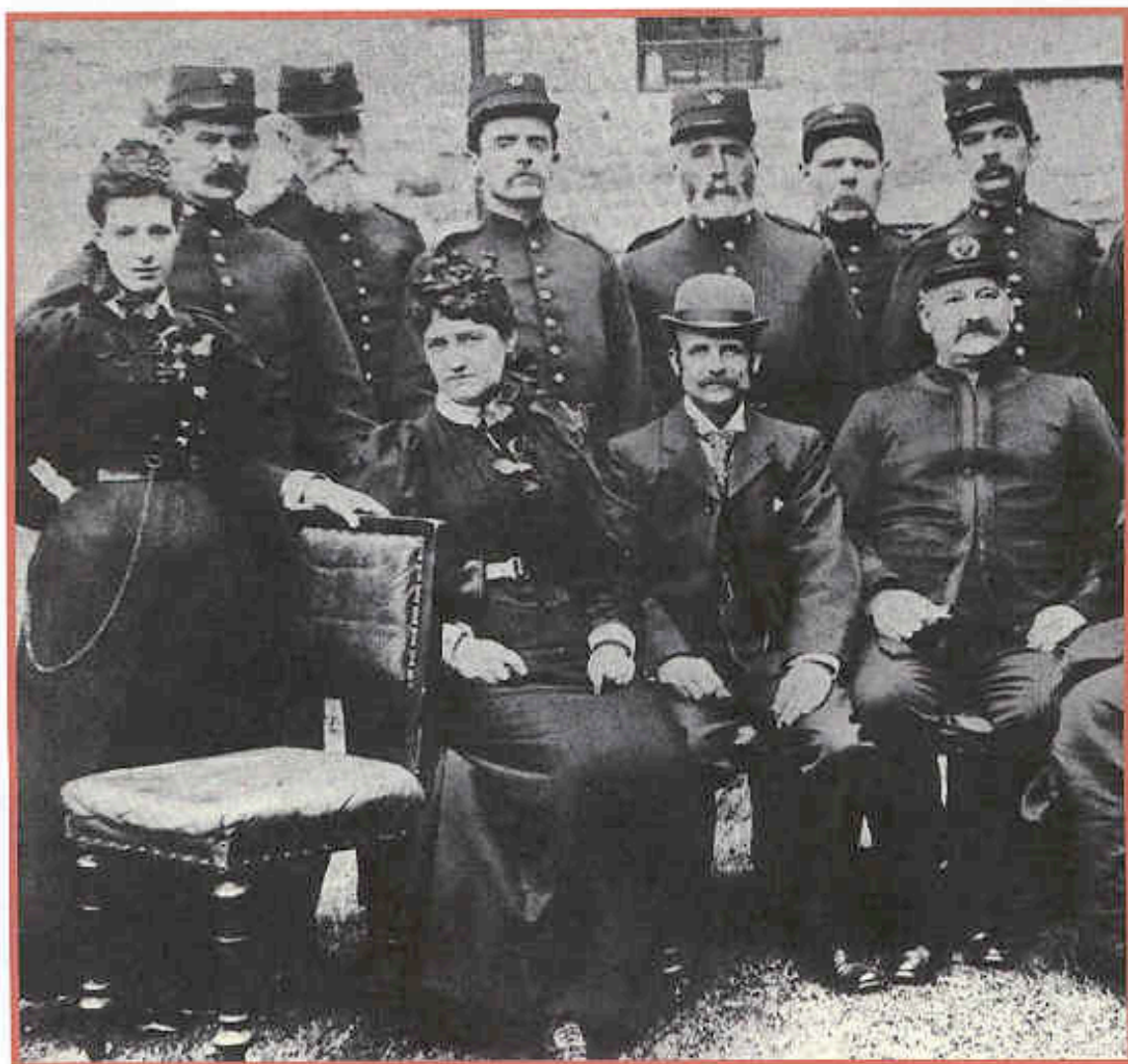
Staff at Caernarvon County Gaol, 1892 [CP, plate 56, detail]