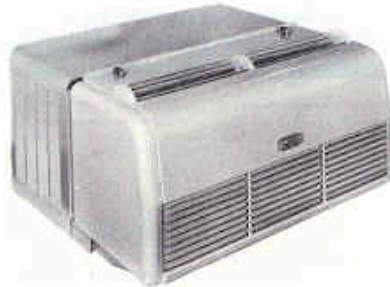
Window-box conditioner, USAC c.1950