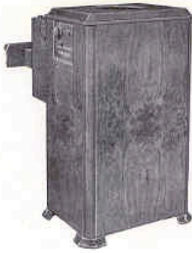
Console room air conditioner Frigidaire 1936