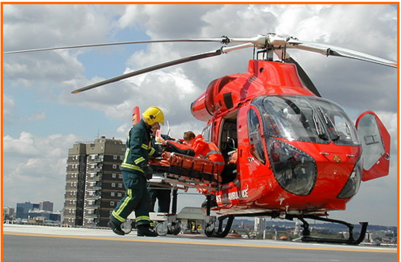
Paramedics delivering stretchered patient from helicopter on roof of London Hospital