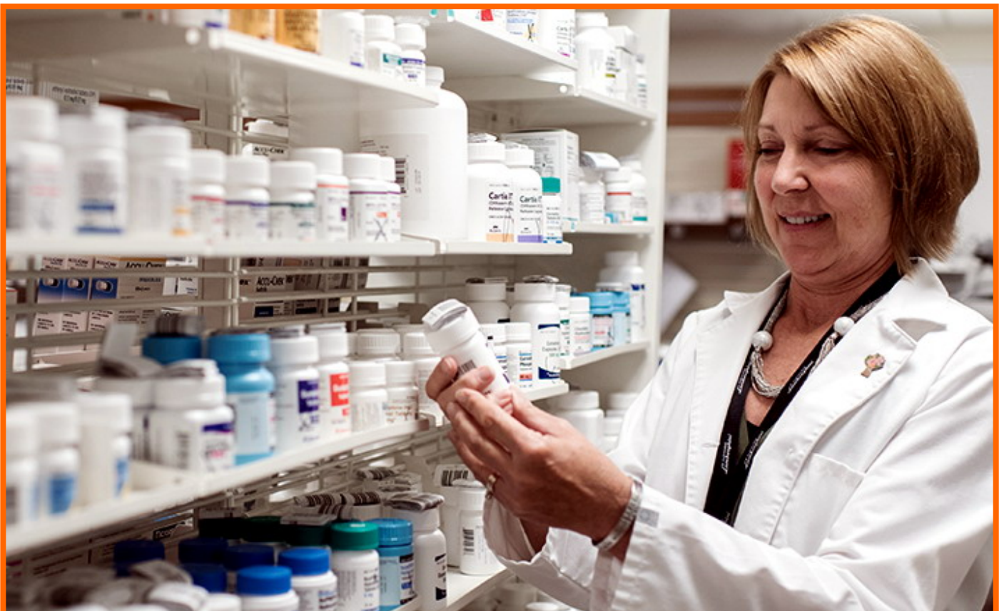
An important job is in the pharmacy organising the storage and distribution of medicines