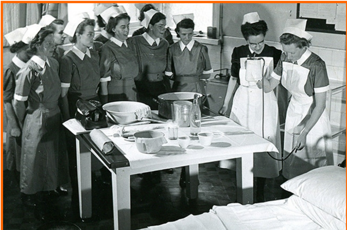
An early NHS image Oldham Royal Hospital