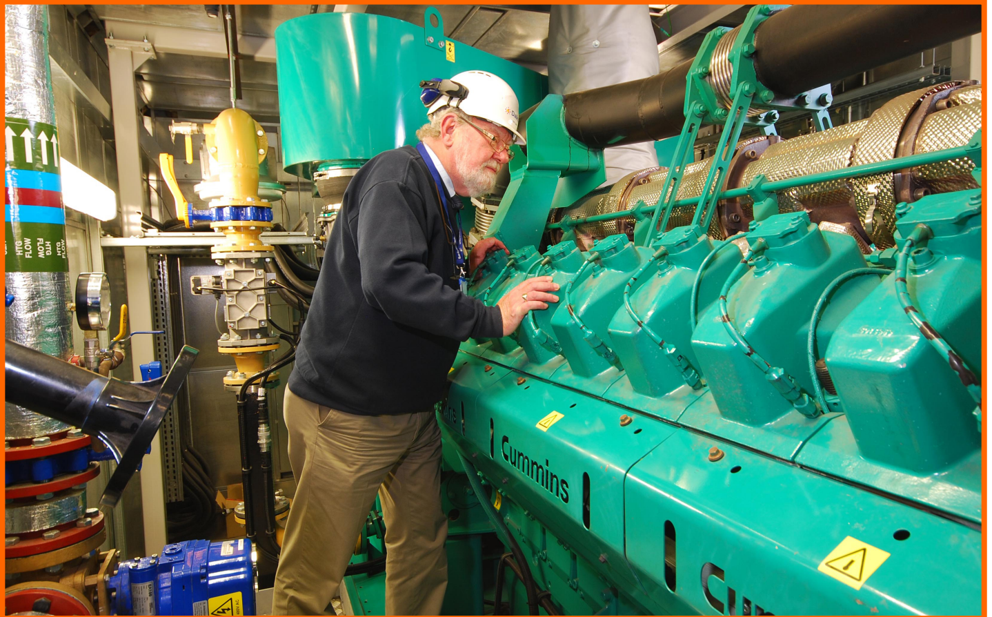
Southampton University Hospital doubles CHP (Combined Heat and Power) Capacity 2013