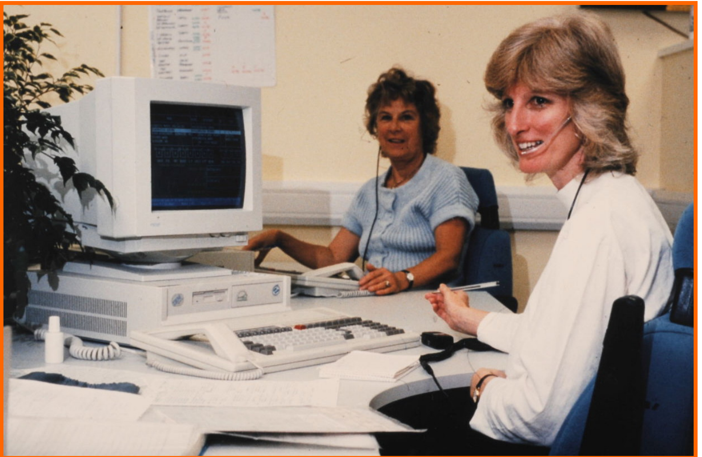
Ladies operating hospital telephone and computer services