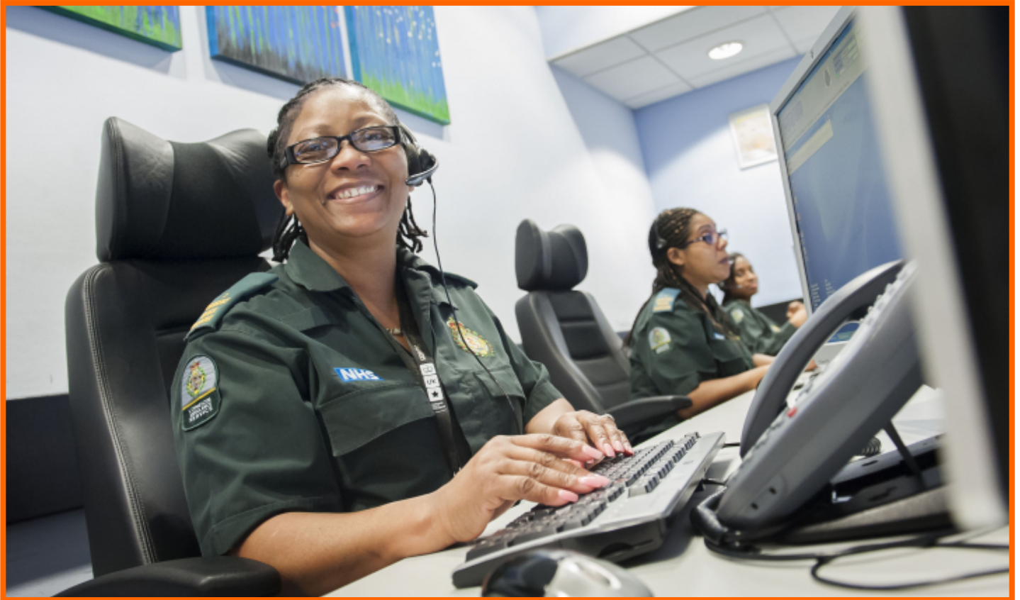
Call handlers- emergency medical dispatch unit