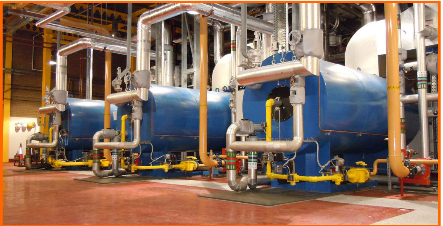
Gas-fired Steam Boilers at Bedford Hospital 2017

The CIBSE Heritage Group is made up of a number of like-minded professionals, many retired, who have spent a lifetime in building services and bring that experience to bear in discovering, analysing and recording the history of the Built Environment, this essential aspect of the world we live in. It is the longest established CIBSE Special Interest Group (1973).