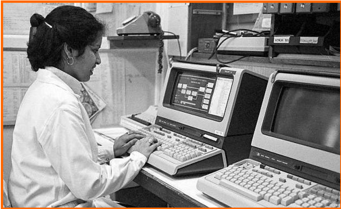
Doctor using an early hospital computer in the 1980s

We conclude our tribute to hospitals and staff since the formation of the CIBSE in 1976 with a selection of photographs of the NHS including the 70th Anniversary celebrations in 2018.