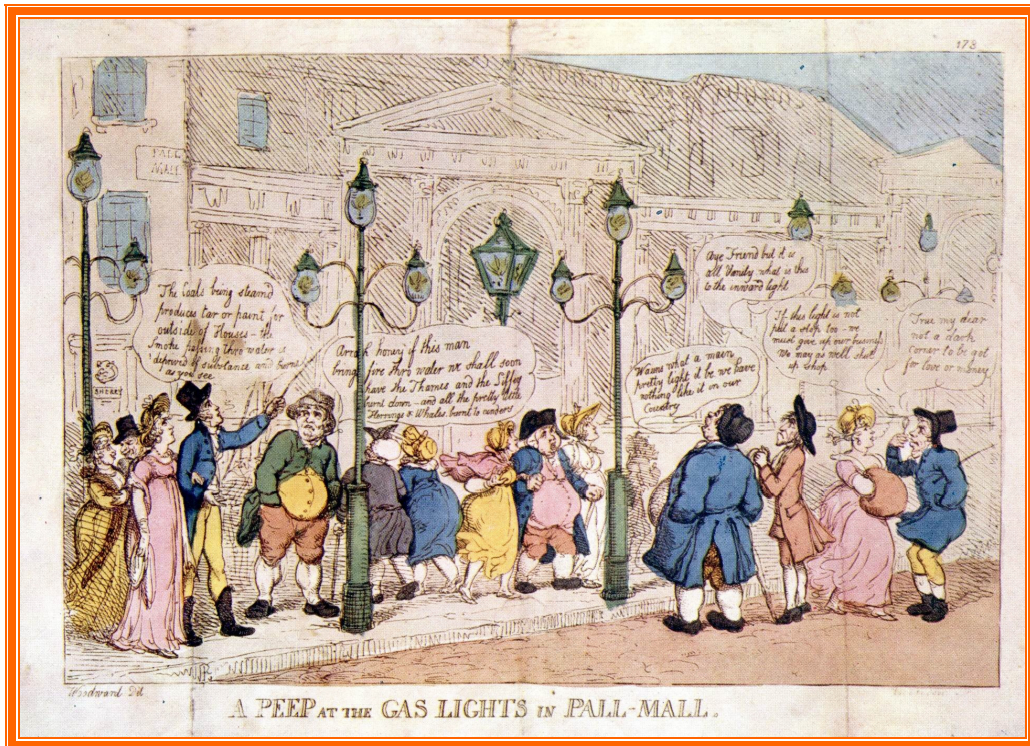
Pall Mall Gas Lighting, 1807