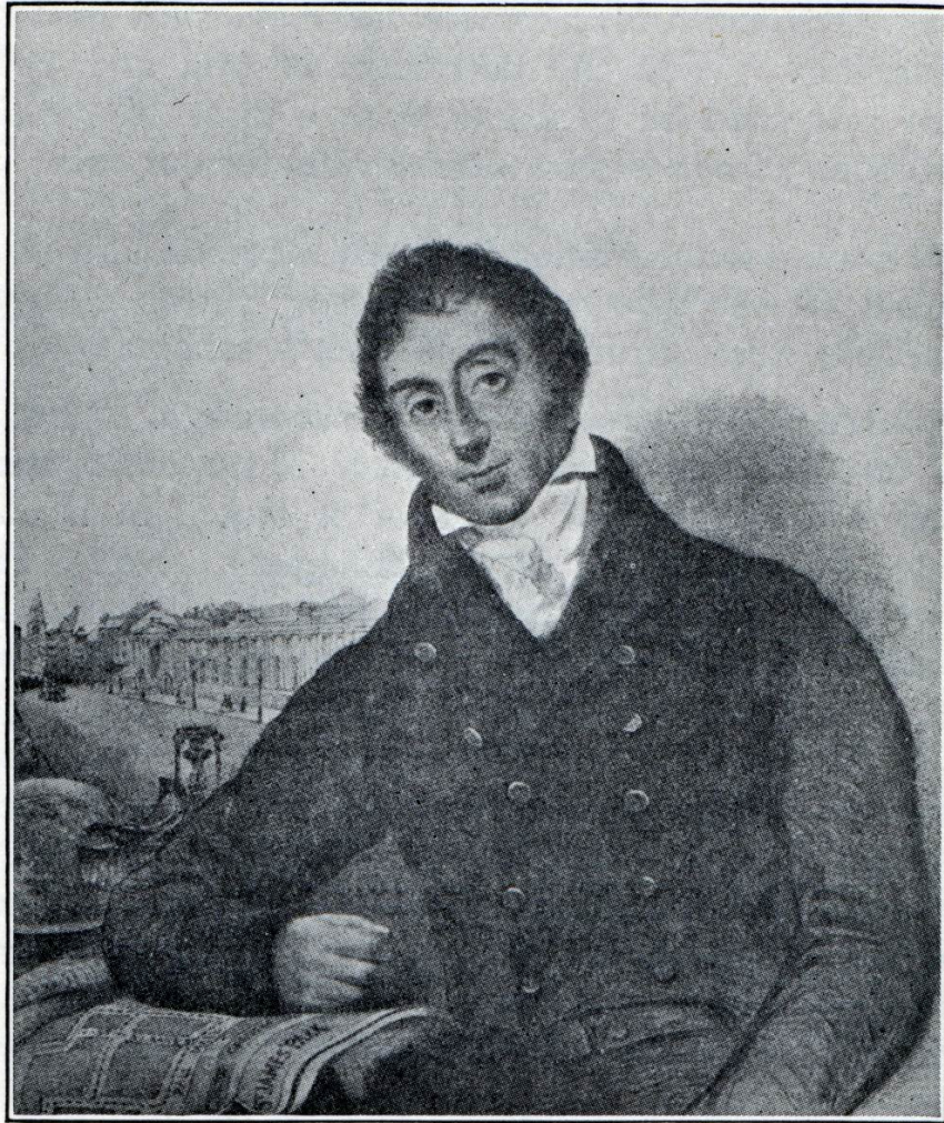
F. A. WINSOR (1763-1830), a persistent exploiter and propagandist.

He was the chief figure in preparing the way for the formation of the first gas company. Pall Mall, London, the first street to be lit with gas, is seen in the background of this contemporary portrait of Winsor.